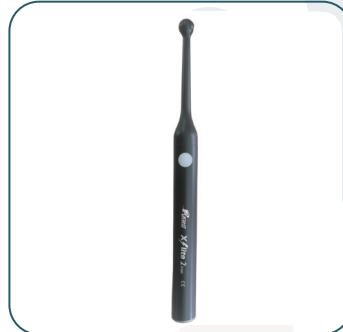
XLITE 2 NEO LED CURING LIGHT