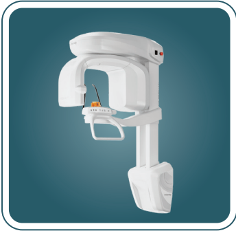
I-MAX 3D XPRO