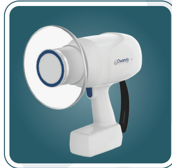
OWANDY RX PORTABLE