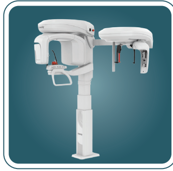
I-MAX CEPH PRO