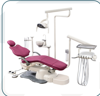
A6 RADIUS PACKAGE