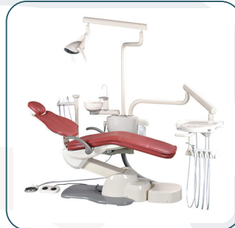
A6 STANDARD PACKAGE