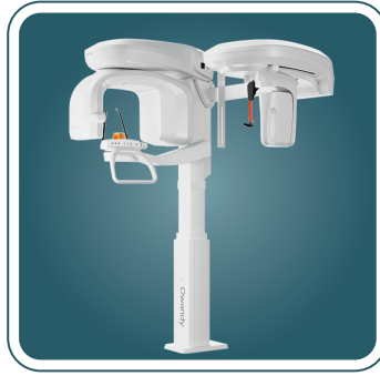
I-MAX 3D CEPH XPRO