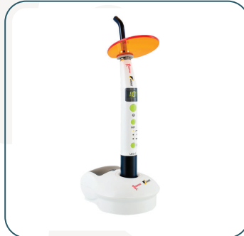
X-CURE CURING LIGHT