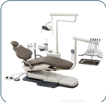
A12 OPERATORY SYSTEM